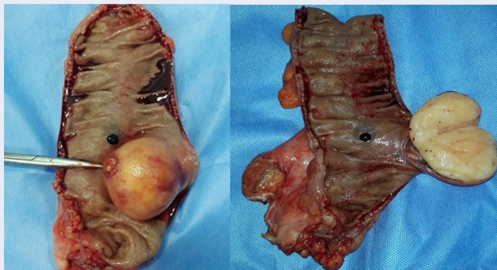
Figure 2: Sigmoid lipoma before and after bisection.

are gastrointestinal bleeding (54.5%), abdominal pain (42.4%), change in bowel habits (24.2%). Other rare symptoms include intestinal perforation, intussusception, and rectal prolapse 5-7 . However, some have larger colonic lipoma but have no symptoms at all. Those situations delay the making of diagnosis and, therefore, may increase the patients' risk. Furthermore, colonic lipomas may mimic colonic cancer in presentation due to the similarities in age and symptoms 8 .