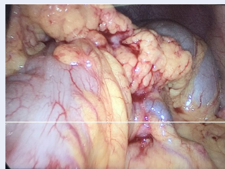
Figure 3: Intussusception in the sigmoid colon due to a fatty tumor

colonic lipoma have a good prognosis. The rate of malignancy of colon lipoma has not yet been recorded 1 . Computer tomography (CT) and MRI are also used to access one with colonic neoplasm. Because of characteristics for fatty tissue, they can illustrate colonic lipomas and the position, adjacent lesions, or complications. But just like colonic endoscopy, CT or MRI may mistake a large tumor with other kinds of colonic neoplasms. Therefore, they are not used to confirm the problem 11 .